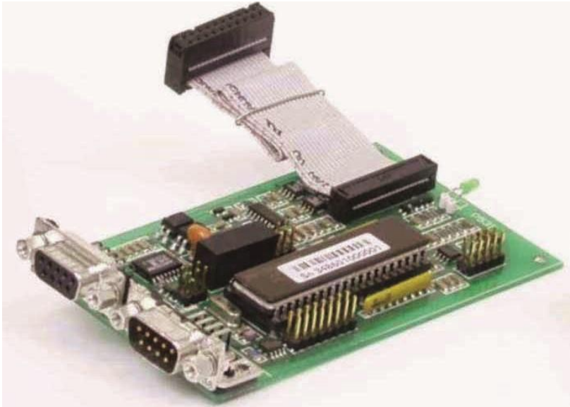
Card for inserting in power supply