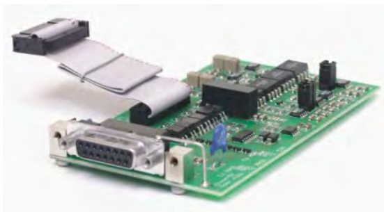
An ISO AMP CARD should be used in case of a non-floating programming source.