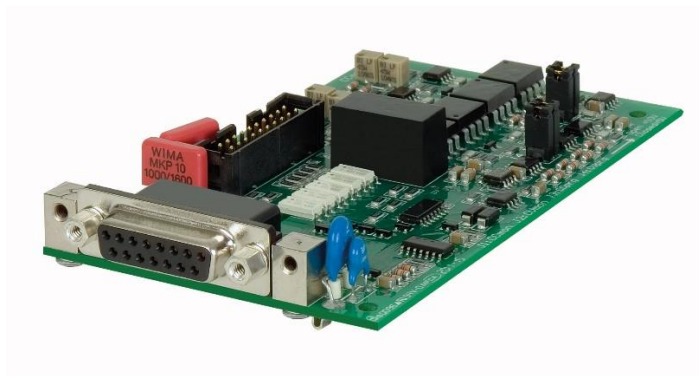
Card for inserting in power supply